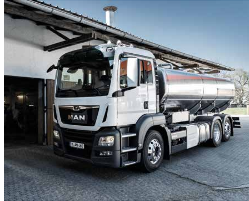
Milk collection vehicle. Left side of frame with offset exhaust muffler; right side of frame kept free ex works to reserve space for the superstructure's attachments (roller shutter, see right)