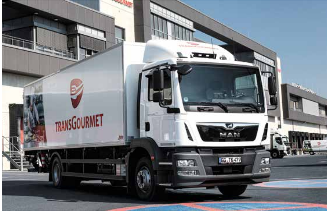
Conversion of 120KD power take-off from flange connection to pump connection