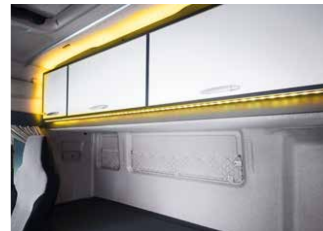
Storage can be this good: exterior LED lighting on the storage cabinet with various colour programmes