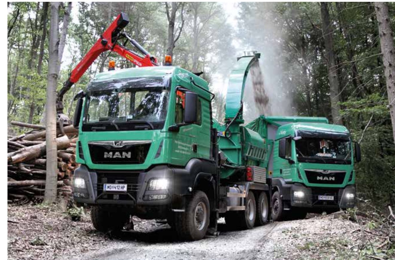
Wood chipper in use

Powerful, rugged and reliable in the forest and on the field: MAN special transporters for agriculture and forestry.