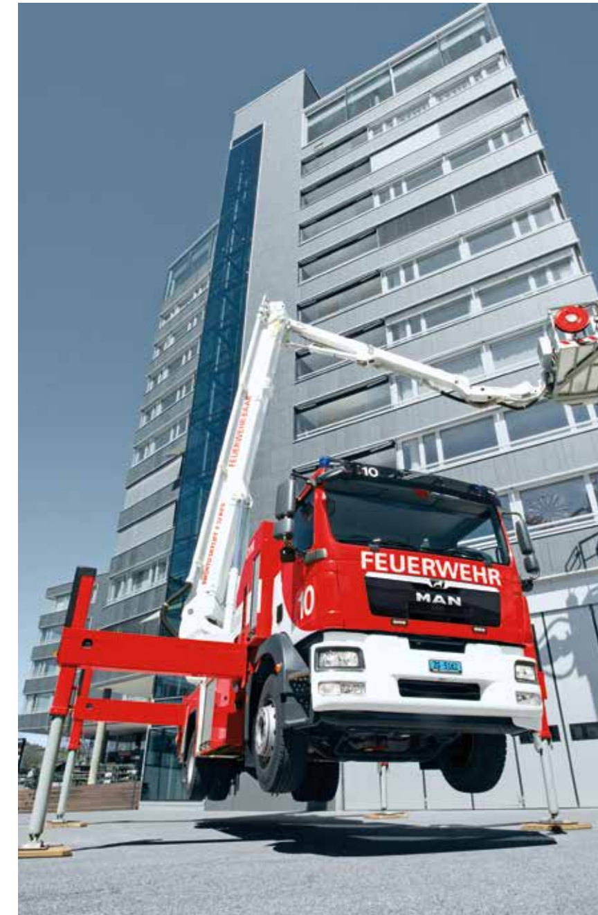
Frame trim, roof modification and wheelbase modification for skylifters