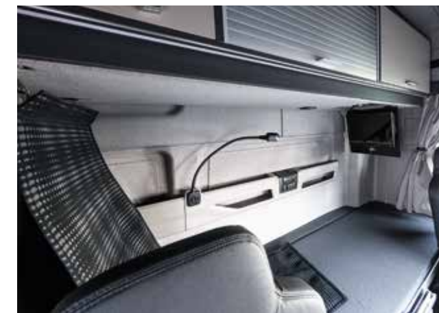
A rested driver drives better: a hammock for relaxing