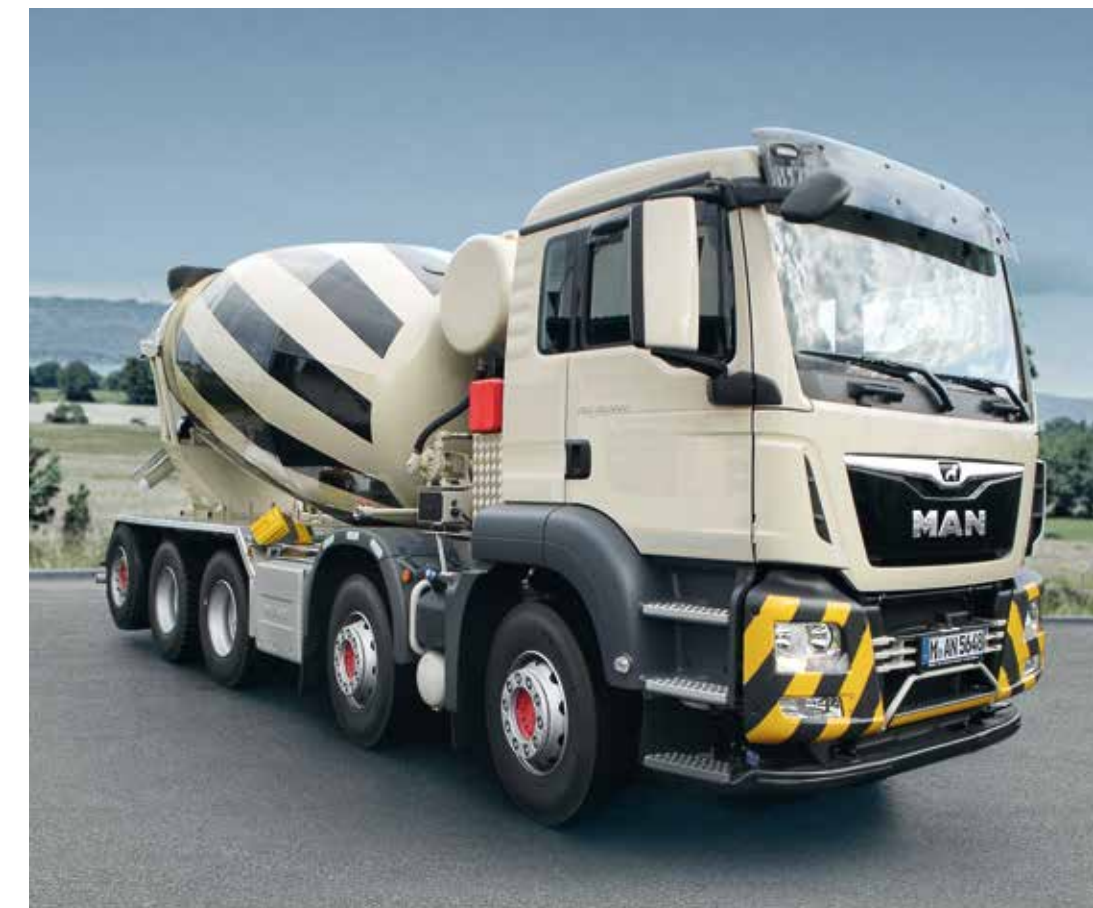
Trailing axle fitted (five-axle vehicle ex works)

Efficient and suitable for the construction site: MAN truck mixer vehicles.