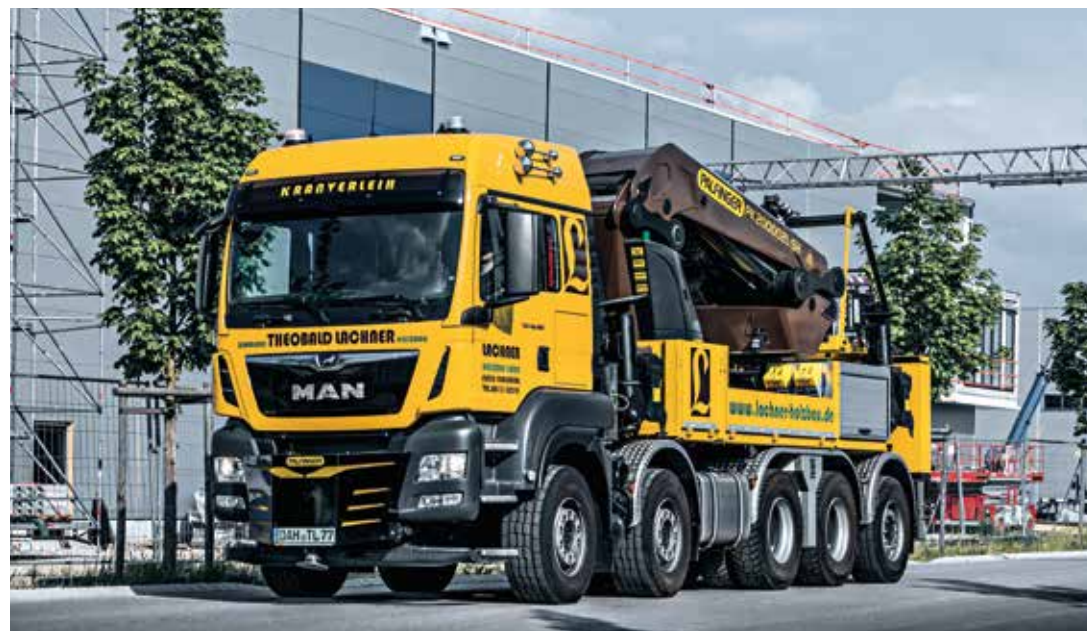
Retrofitted leading axle