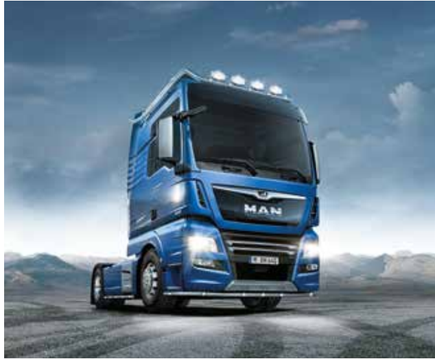
Vehicle lighting, e.g. auxiliary headlights or LEDs