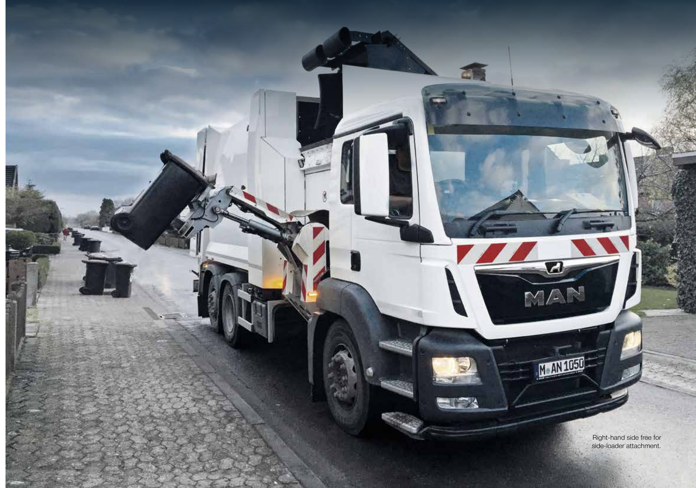
Right-hand side free for side-loader attachment.

fulfil the stringent DIN requirements for refuse collection and are optimally prepared for the seamless assembly of all refuse-collector bodies, whether they are front, rear or side loaders, fixed or swap-body systems. To ensure that just one vehicle can be used to transport cargo and crew, the TGS is fitted with a four-seater bench at the factory – disposing of one more disposal concern.