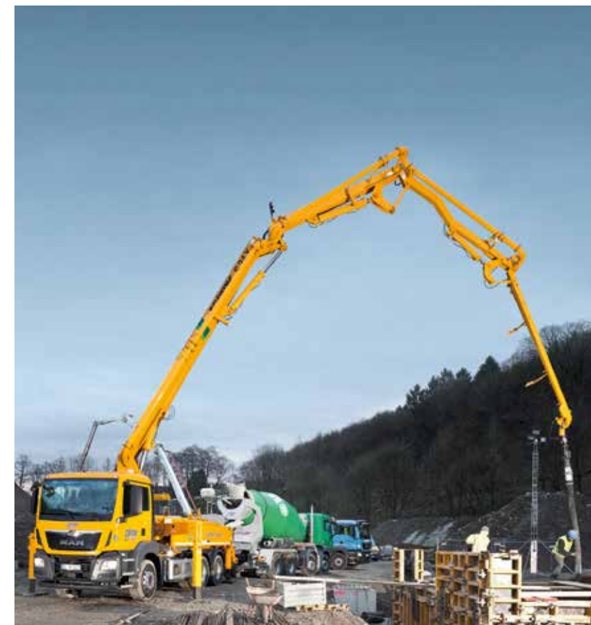
Adjustment to frame trim for concrete pump superstructure