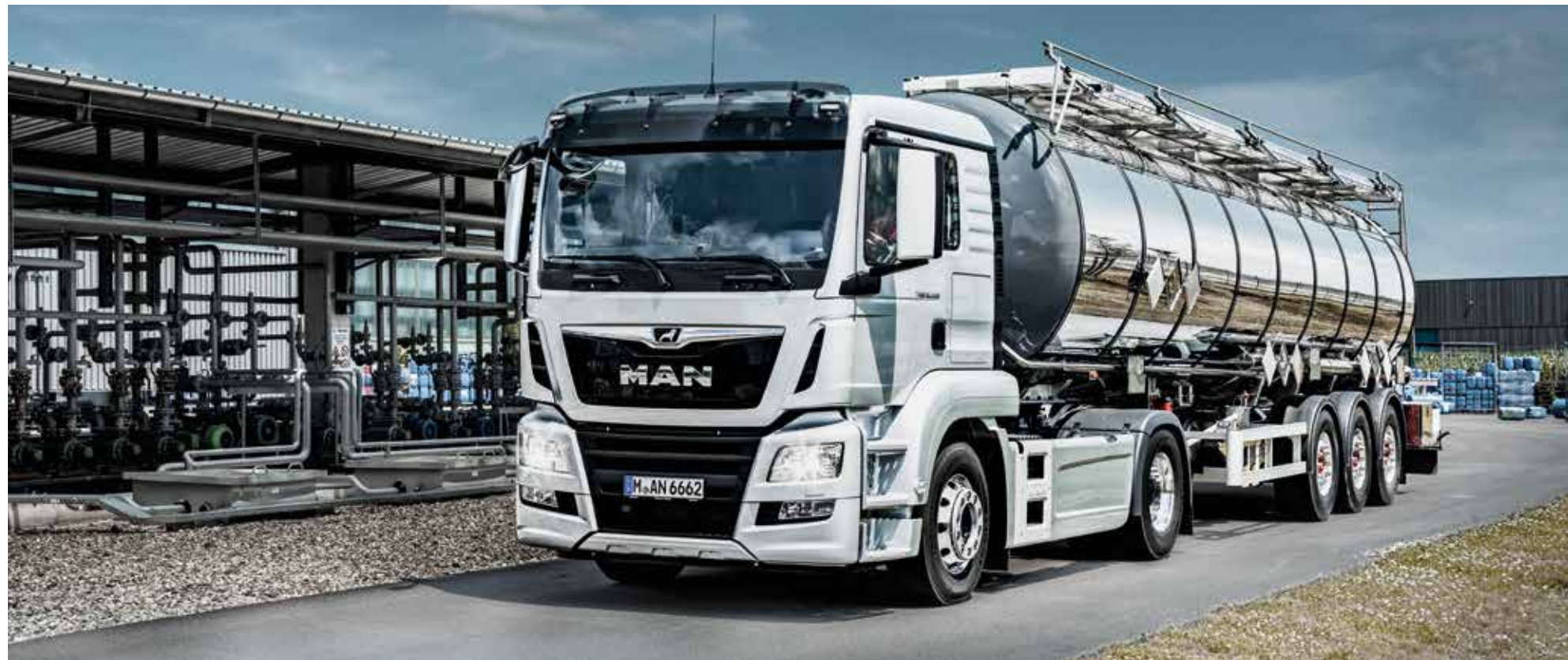
Weight optimisation for tank cradle