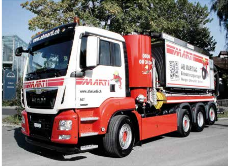
Retrofit leading axle