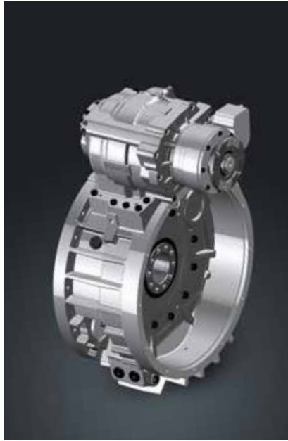
OMSI PTO for vacuum trucks