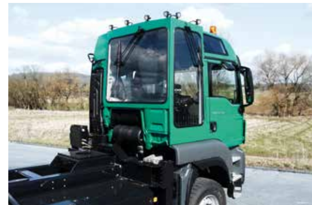
Cab glazing for stationary machinery