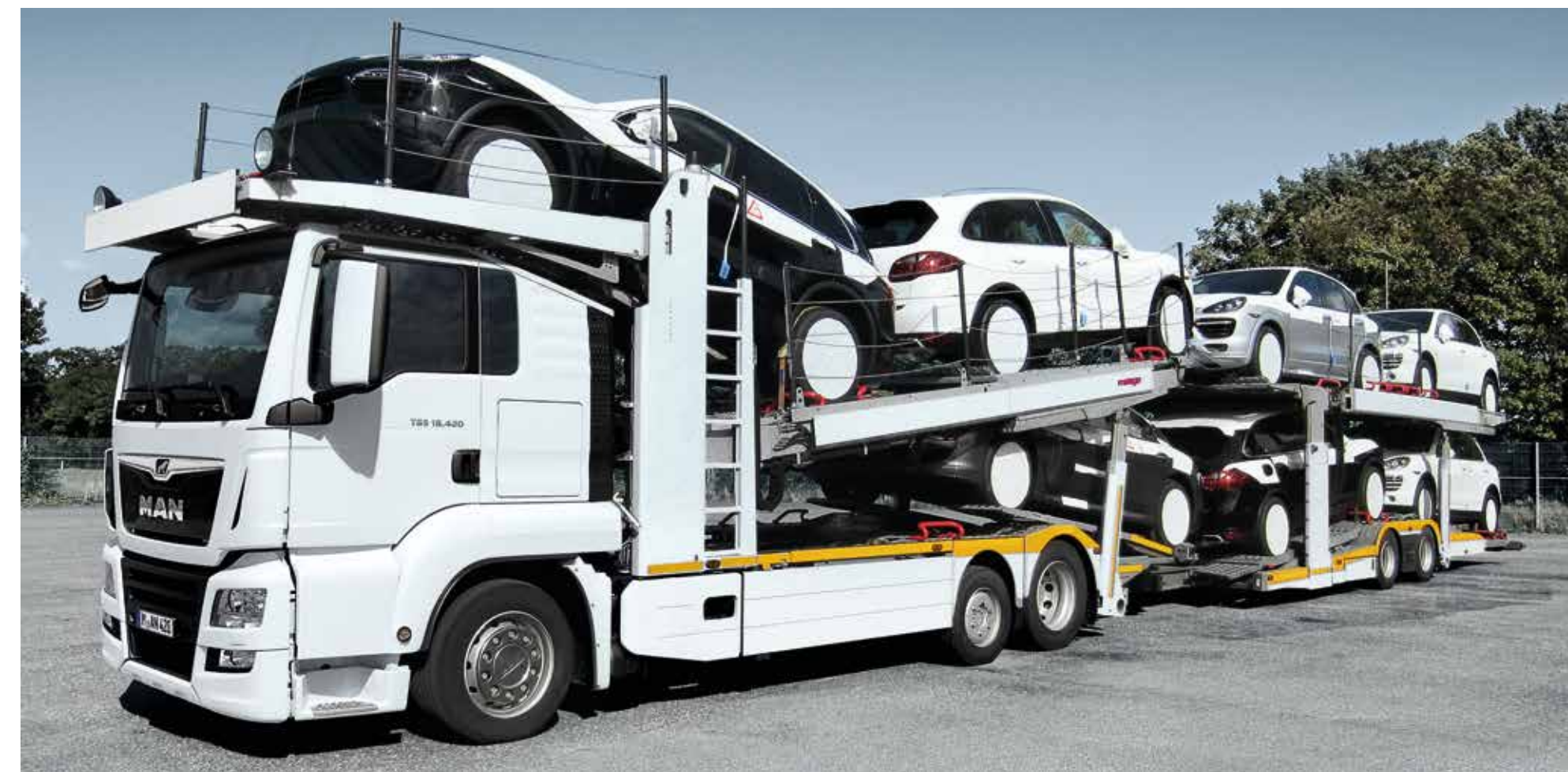
Optimising the vehicle height with flat roof at a 16° angle with an option to adjust the cab mount and fit a leading axle

Thomas Radlauer, Thomas Radlauer Autotransporte