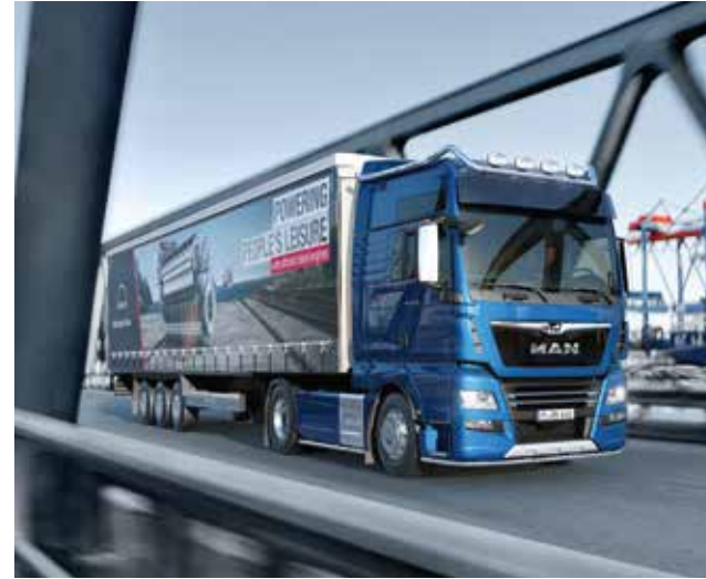
Customisation with stainless steel components.