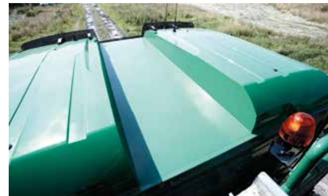
Central roof recess