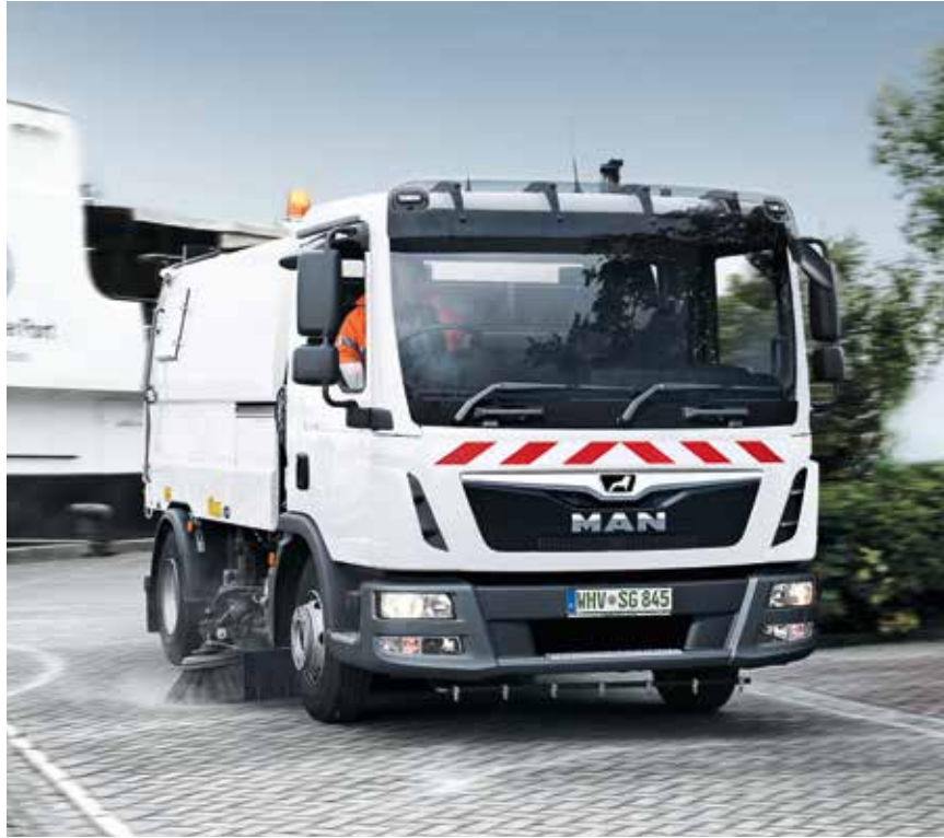
Adjustment to frame trim for sweeper structure