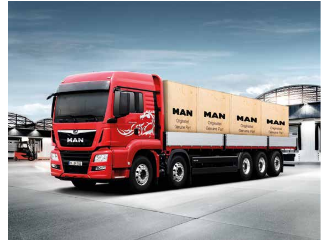
Five-axle vehicle in Korea (wheelbase extension and trailing axle fitted)

Near, far, fast, good. MAN long-haul and distribution transport vehicles.