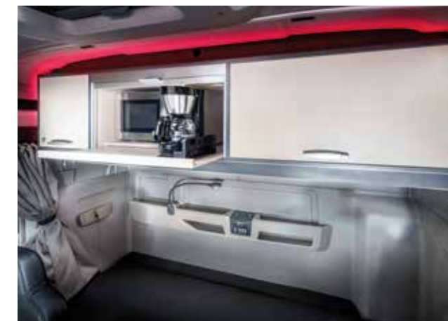
Perfect for the self-sufficient: an on-board kitchen