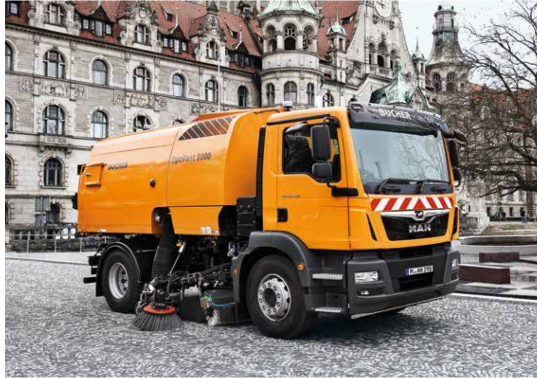
Adjustment to frame trim for sweeper structure