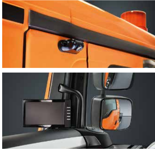
VTA (video turning assistant)