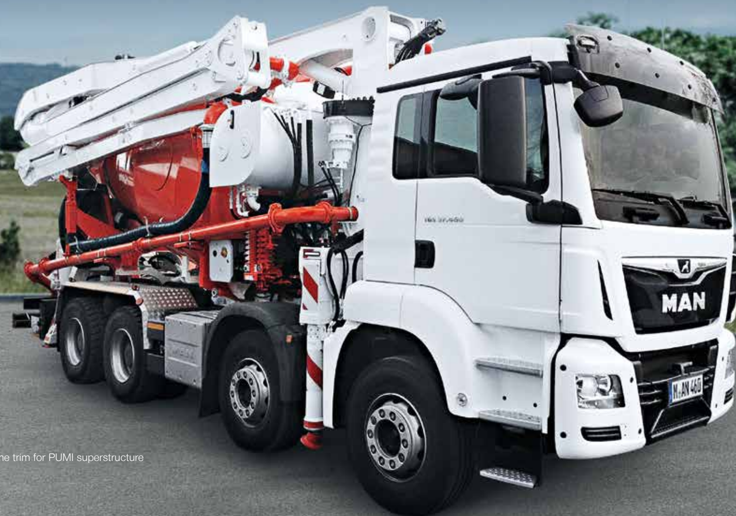
Adjustment to frame trim for PUMI superstructure