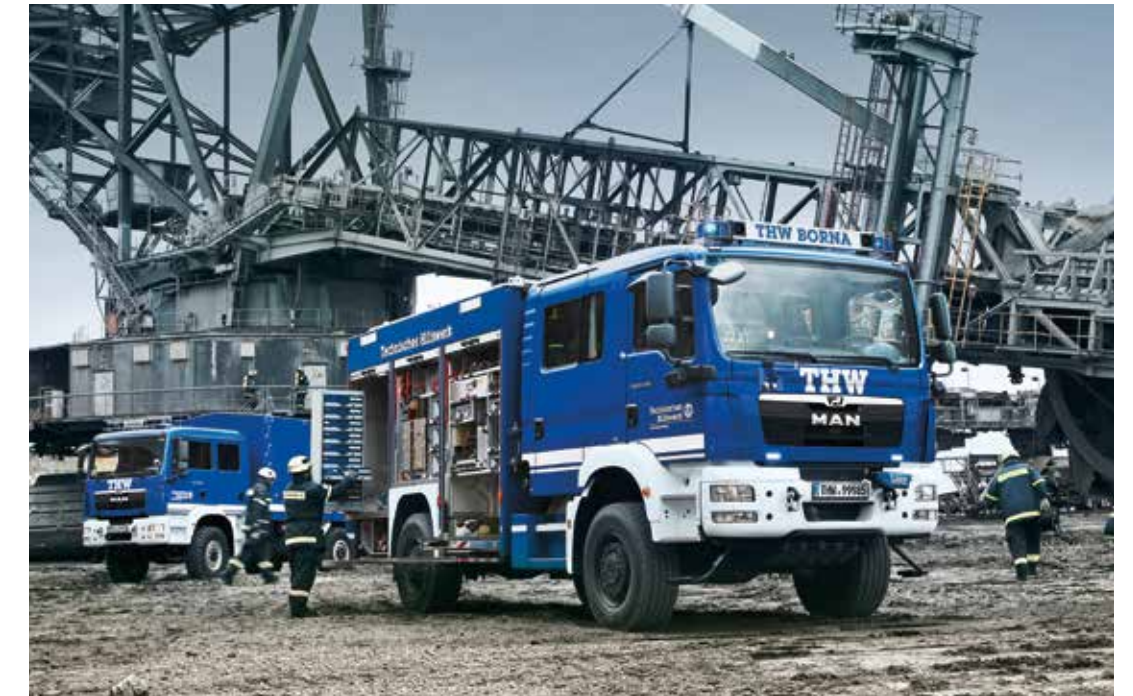
Glass-fibre-reinforced plastic crew cabin (crew of 1+8), signal technology and emergency service radio equipment